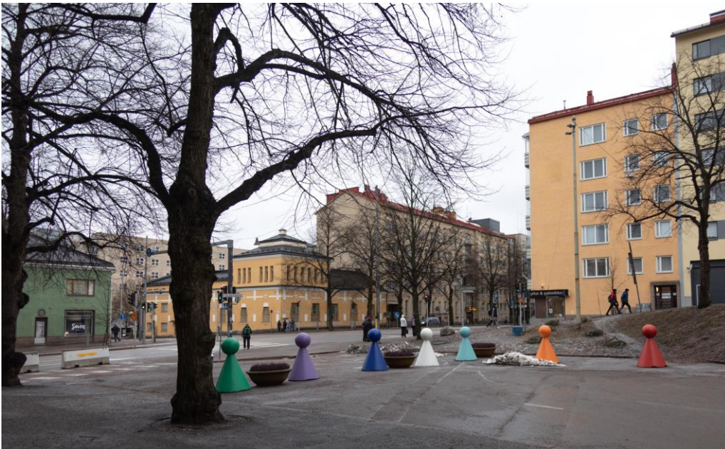
Viiskulma Square in March 2020.

The competition area is the Viiskulma Square. The square is located at the end of Kirkkopuisto, at the junction of Päijänteenkatu, Kirkkokatu and Vesijärvenkatu. The street alignments are derived from the first town plan drawn up by Alfred Caween in 1878.