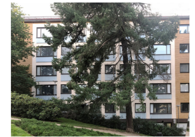
14 Mariankatu 2 1955 Unto Ojonen