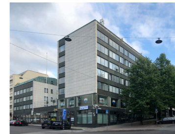
9 Paasinkulma 1959 Unto Ojonen