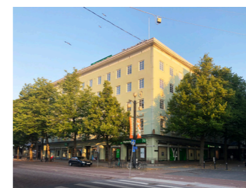
6 Fagerholmintalo 1928 Jussi & Toivo Paatela