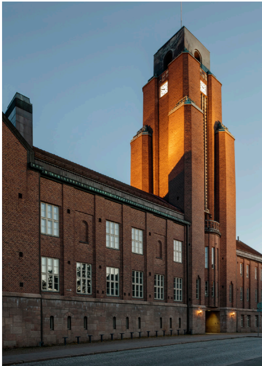
The City Hall 1912 Eliel Saarinen

The two buildings both bookended by towers are designed by the two internationally most renowned architects in Finland. The Church of the Cross completed in 1978, designed by Alvar Aalto, is situated at the north end of the avenue on a hill. At the south end of the avenue, also on a hill, lies the City Hall from 1912, a masterpiece of Eliel Saarinen.