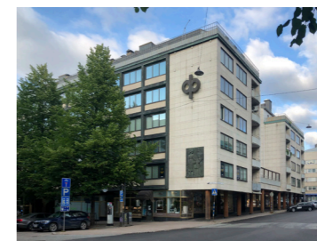
7 Rahatalo 1956 Unto Ojonen